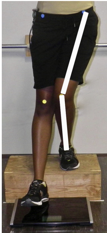
Fig. 1. Single-leg step-down test. Note the dynamic knee valgus of the stance leg, indicating weak hip musculature, suggestive of increased ACL injury risk.

Neuromuscular control and muscular strength are key factors in RTS. Although the importance of quad and hamstring strength to ACL rehabilitation are well known, hip and core strength have recently been shown to predict noncontact ACL injury. 80,81 The impact of hip, core, and trunk strength on ACL injury risk is even more robust in female athletes, as studies have shown more risky landing and cutting mechanics in females. 1,82 As the influence of the hip and trunk in the ACL injury mechanism is better understood, it is important to target rehabilitation efforts to treat these deficits and to use screening tests that can accurately gauge hip, core, and trunk function. Although many functional tests have been proposed, the single-leg hop tests, the single-leg step-down test ( Fig. 1 ), and the Y-balance test ( Fig. 2 ) have shown particular utility