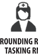
ROUNDING RN, TASKING RN