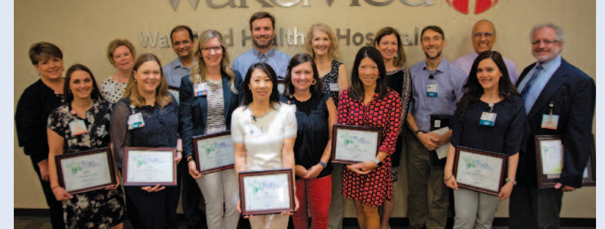
Pictured clockwise from top left: Cardiac Rehab, Heart & Vascular - Apex.