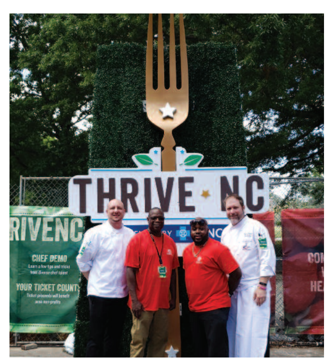
WakeMed was proud to be a sponsor of Thrive NC, a Food, Culture, Community festival at City Market in early May. Our chefs served a delicious healthy Asian salad – if you want to try it at home, look for the recipe on the WakeMed Voices blog.