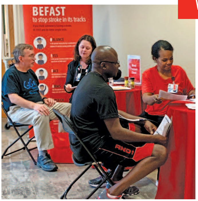
Cary Hospital hosted Men's Health Night in early June. The event drew hundreds of men of all ages for screenings, health education, seminars and more. Thank you to everyone who helped make this event such a success!