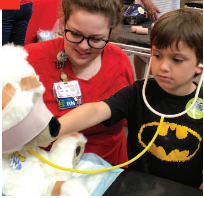
WakeMed's Child Life Specialists led the annual Teddy Bear Clinic at Marbles Kids Museum in May. The event is a fun opportunity for young children to learn about what is involved in a hospital visit and learn about the role doctors and nurses play in the community. Thanks to everyone who helped make this event so much fun!