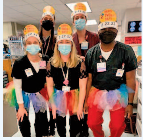
The Raleigh Campus Pharmacy team celebrated "Twosday" on February 22, 2022, by wearing tutus, hats and participating in other "two" themed activities.

WakeMed employees had a chance to learn about educational support available – including tuition and specialty certification reimbursement – as well as hear from local colleges and universities at the annual Education Fair. To learn more about how WakeMed can support your professional and educational development, check the Learning & Development page on MyWakeMed or contact Workforce Development.