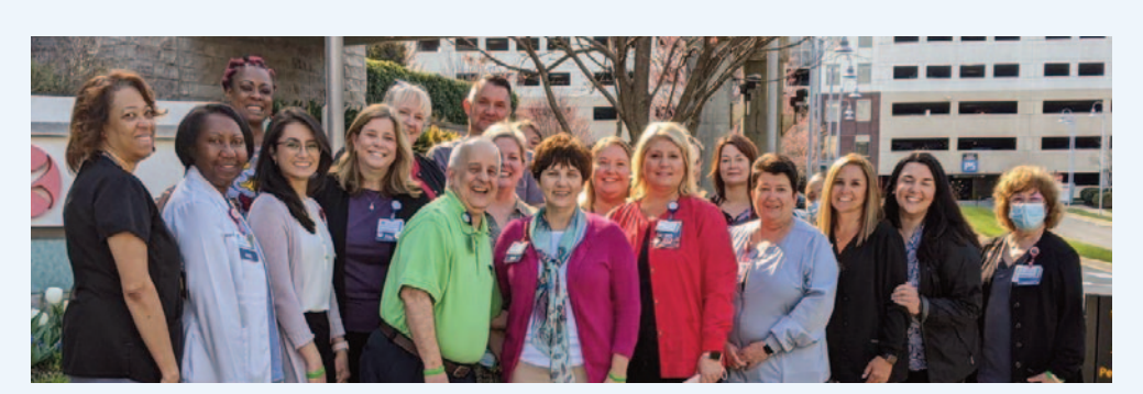
On April 6, WakeMed and HonorBridge administrators, physicians, staff and nurses gathered at WakeMed to honor and celebrate organ and tissue donors with the annual raising of the Donate Life flag. In 2021 the WakeMed team helped carry out organ and tissue donors' wishes by making 47 organ and 104 tissue donations possible – the highest numbers in WakeMed's history and throughout the HonorBridge service area.