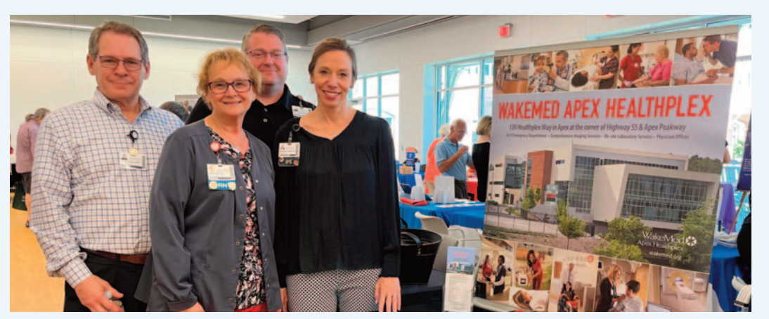
Apex Healthplex and WakeMed Rehab staff offered blood pressure checks and screenings at the Apex Senior Health Fair in September. The event was an opportunity to connect area seniors with the services available at WakeMed and, specifically, Apex Healthplex.