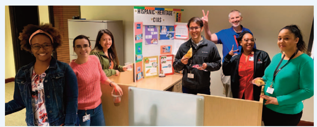
Integrity & Audit Services celebrated Hispanic Heritage Month by tasting some special food and beverages representative of different Hispanic cultures. Hispanic Heritage Month is recognized each year from September 15 to October 15.