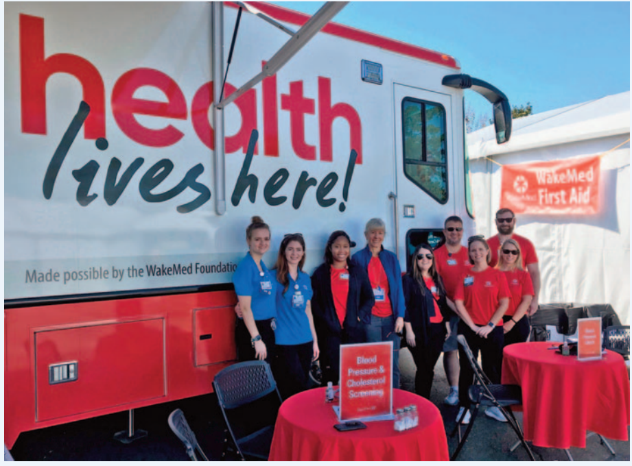
WakeMed once again provided blood pressure and cholesterol checks as well as first aid support and health education at the annual SAS Championship at Prestonwood Country Club in October.