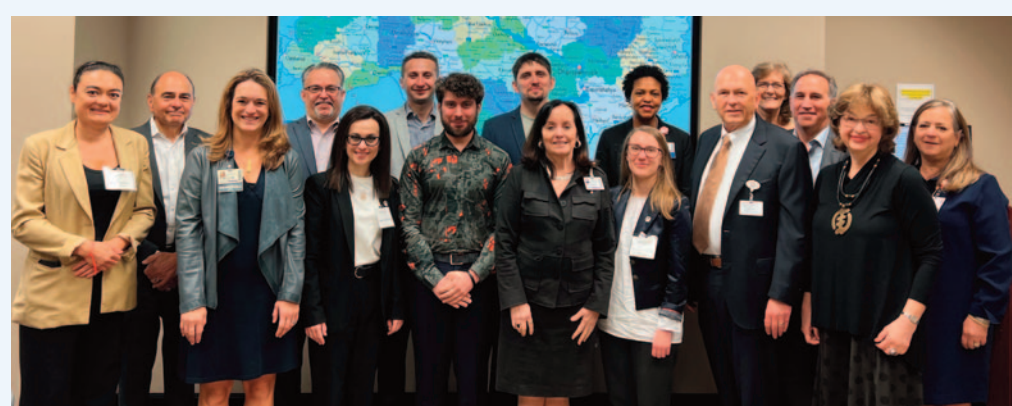
Bottom right: In February WakeMed hosted several physicians from Ukraine for a day of sharing experiences, best practices and knowledge. The group had an opportunity to learn about and tour our cardiology, emergency medicine, OB-GYN, rehab and cancer care areas. It was an educational and informational day for all, centered around a shared passion for providing the best health care possible, no matter the circumstances.