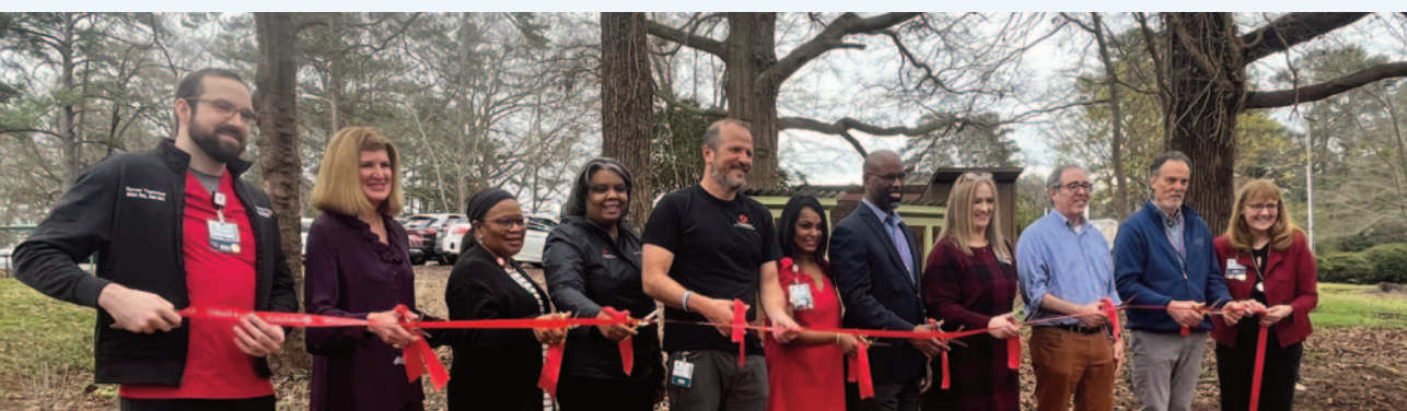
The Nursing Night Shift Council hosted a ribbon cutting ceremony for the first WakeMed Blessing Box, located by the Center for Community Health and Alliance Medical Ministry, in early March. The Blessing Box includes clothes, shoes, nonperishable foods and hygiene items and has been used regularly since opening.