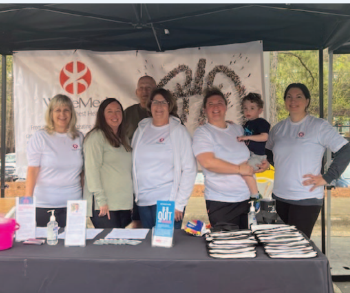
With the support of team members across WakeMed, team We be-LUNG Together raised $6,835 for the Lung Cancer Initiative in the 2023 Triangle LUNGe Forward 5K Run, Walk & Celebration in March. WakeMed was the second highest fundraising team. Thank you to everyone who supported this year's event – your passion for those affected by lung cancer makes an impact on our community.