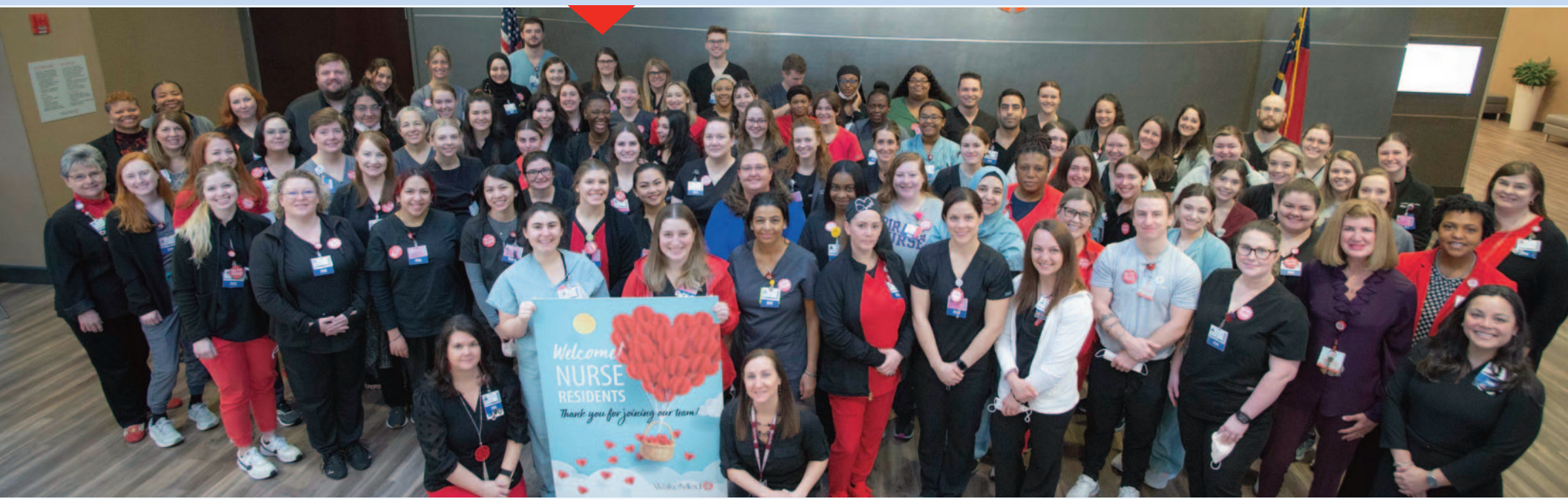
The Spring 2023 cohort of Nurse Residents joined the WakeMed family in February. At 98-residents strong, this cohort is the largest ever since the program began in 2005!