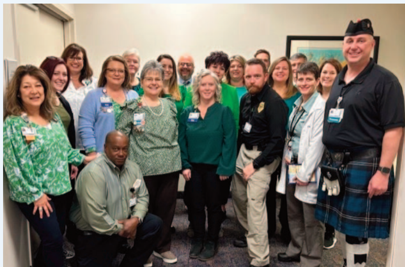
Cary Hospital administration and leaders wore their best greens on Friday, March 17, to celebrate St. Patrick's Day!