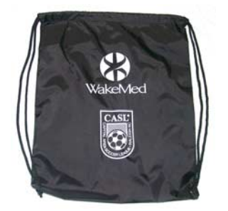
Each player gets a FREE drawstring backpack for participating!

Simply let your coach know that you want to participate and then sign the enclosed pledge card. Review the five points listed below and plan ahead to make sure you follow these challenges at every game and practice. We've also included nutrition information that we hope you will find helpful on being a strong athlete. At the end of the season, participants will receive a drawstring backpack!