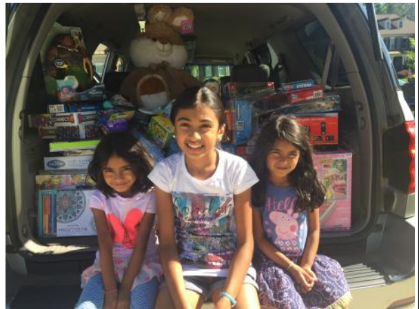
Donation from the Prasad Family