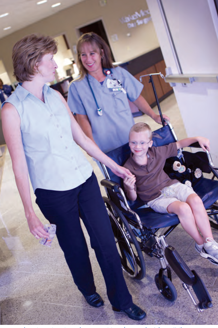
When it was time to go home I got to ride in a wheelchair all the way to the car! Having my tonsils taken out wasn't so bad after all.