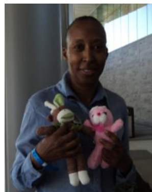
Geanneau Moma Donations of toys