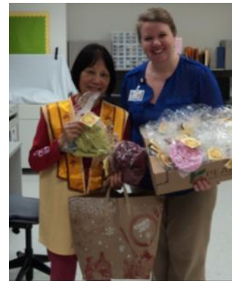
Fo Guang Shan Temple