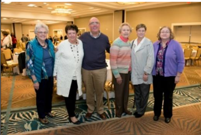
North Ridge Country Club Sewers

Many thanks to ALL of the amazing men and women who give of their time and talents to WakeMed patients, families and staff members