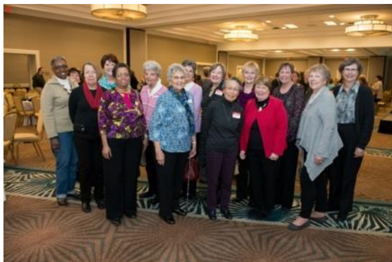
Carolina Preserve Sewing Group