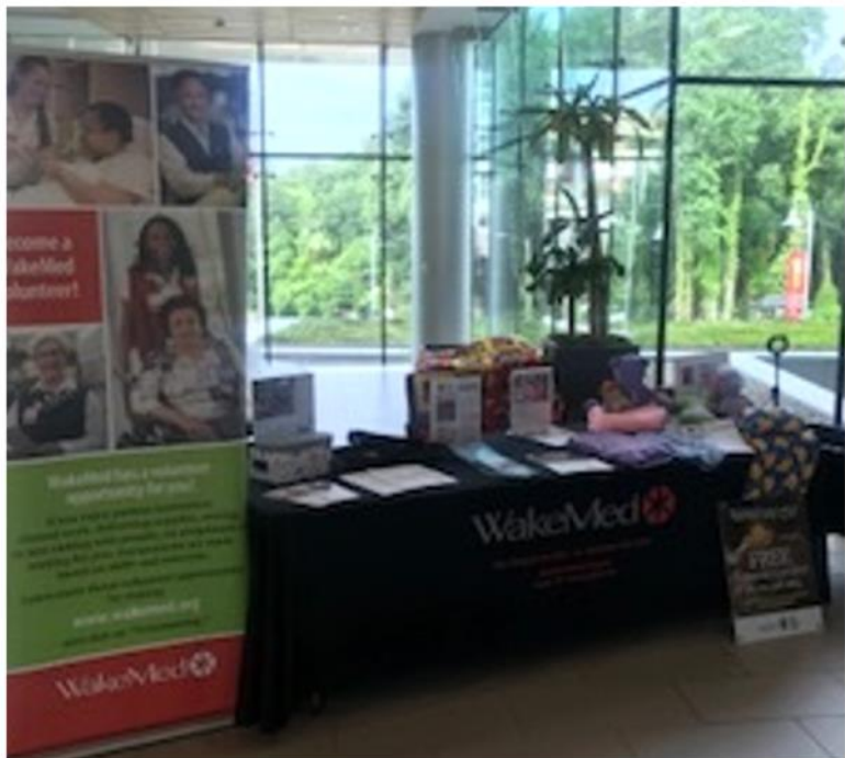
Community Sewing items on display