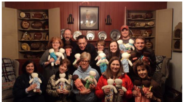
Hayes Barton Group with huggables