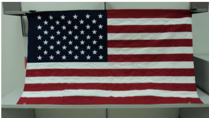
Project Linus donated an American Flag Quilt to the WakeMed Raleigh Campus.