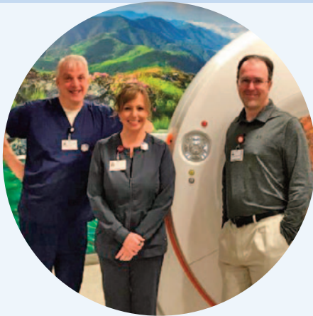
210 PET Imaging, a joint venture between WakeMed & Raleigh Radiology, recently celebrated their two-year anniversary of providing state-of-the-art imaging services to our community. 210 PET Imaging, located on the first floor of the Medical Park of Cary, has helped improve outcomes in over 2,500 oncology patients over the first two years.