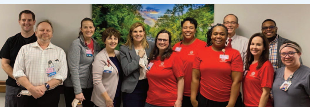
The WakeMed Children's – Pediatric Cardiology team welcomed youth athletes to the Heart Center for SportFit Heart: a FREE EKG Screening event. Attendees received complimentary EKG screenings, intended to identify potential life-threatening conditions. In addition to screenings, athletes and their families had an opportunity to learn about bystander CPR and learn important, athlete-focused, nutrition tips.