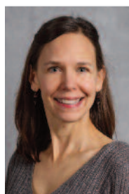
Elizabeth Eskridge Pathology Labs - Raleigh Campus