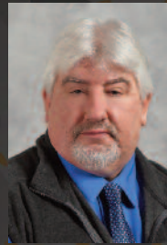
JC Fairchild Facility Services – Raleigh Campus