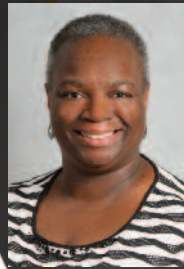
Lathanette Creasman Collections