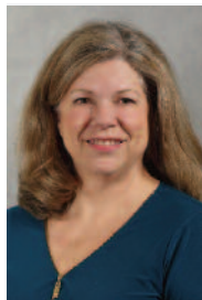
Keely Stone Imaging Services – Raleigh Campus