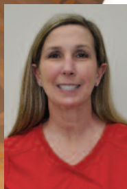
Leigh Frazier Imaging Services - Cary Hospital