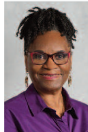
Joyce Ray Staffing Resources – Raleigh Campus