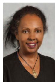
Zenebwork Gobeau Heart & Vascular Unit - Cary Hospital