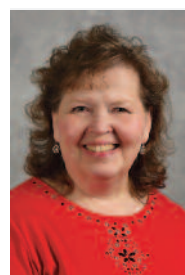
Nancy Hicks Outpatient Rehab