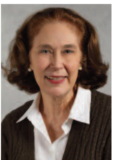
Beverly Steele Physical Therapy – Raleigh Campus