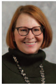
Lisa Chambers Therapy Services Supplemental Pool