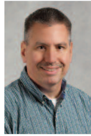
Kenneth Bowen Pathology Labs - Garner Healthplex