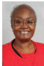
Vivian Simpson Environmental Services – Raleigh Campus