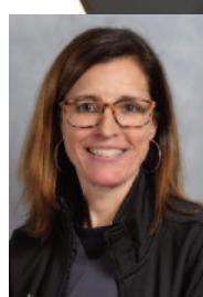
Kirsten O'Brien Physical Therapy