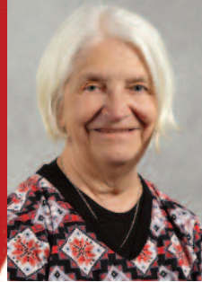
Barbara Holloway Pathology Labs – Cary Hospital