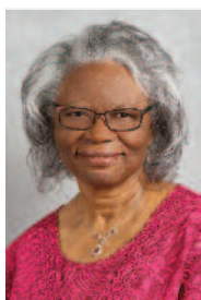
Glory Eni Behavioral Health Services