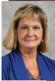
Anne Bruce Pathology Labs – Raleigh Campus