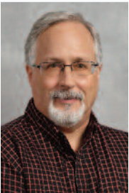
Rex Nufer Information Services