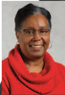
Dorothy Blackmon Pathology Labs – Raleigh Campus