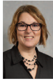
Emily Burt Primary Care