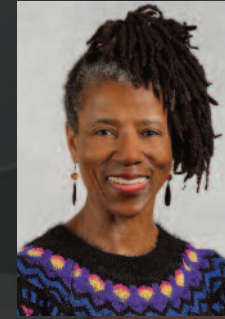
Pamela Townsend Pathology Labs – Raleigh Campus