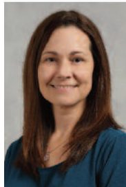
April Parker Imaging Services – Apex Healthplex