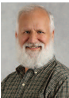
Donald Taylor Facility Services – Raleigh Campus