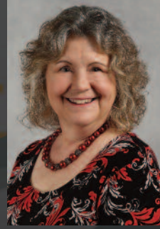
Jean Chard Pathology Labs – Raleigh Campus