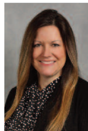
Laurie Slaughter Physical Therapy