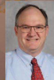
Alfred Smith Pharmacy – Cary Hospital