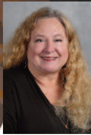
Crane Cooke Rehab Hospital Admissions